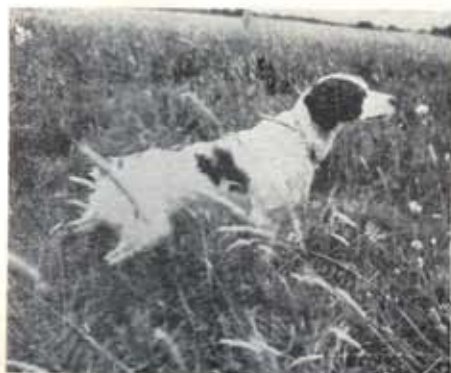
Fld. Ch. FAULKNER'S RIP, the finest dog in the Northwest in the early trials.