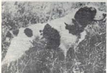
Fld. Ch. HERO'S MASTER SPOT, one of the great ones who died young, excellent field record.