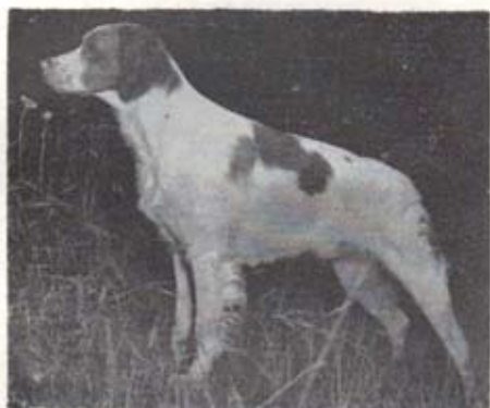
Dual Ch. LUND'S TROOPER, top winner of number of placements.