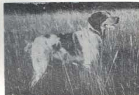
Fld. Ch. HOLLIDAY BRITT'S BAZOOKA, together with Jill, pictured below, produced some of the country's top dogs of the period. An excellent shooting dog with exceptional bird finding ability.