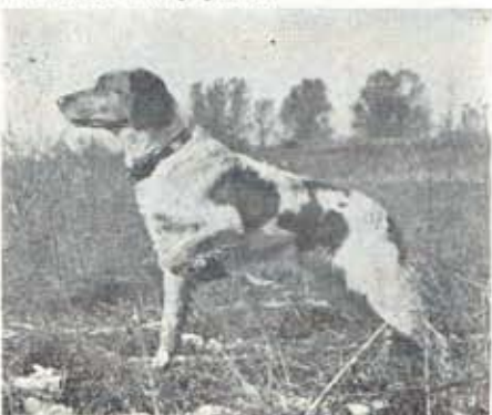
Dual Ch. PONTAC'S DINGO, the top winner and top sire of his era.