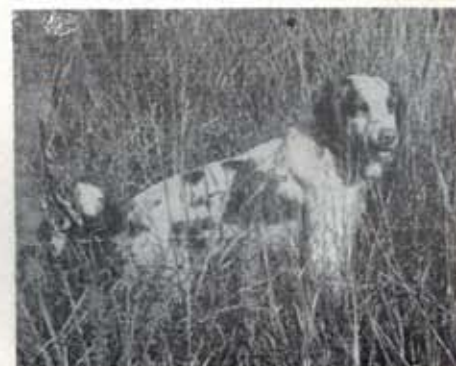
Ch. S-M SAM DE TRIUMPH, not a great winner himself, he sired many good winners.