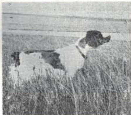
Dual Ch. ANGELIQUE DE BRETAGNE placed consistently in all-breed and in Brittany stakes, introducing the breed to many. A very big-running stylish bitch.