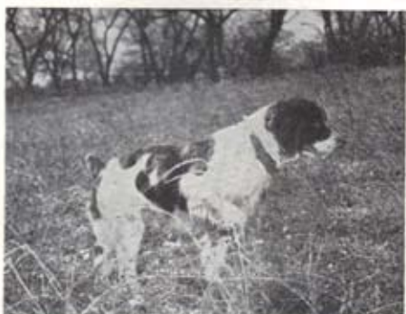
Dual Ch. Way Kan Fritts, National Champion.

The foregoing pictures are those of the most outstanding dogs of their period of which pictures are obtainable.