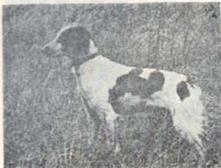
Fld. Ch. MISTE DE KLEMANOR, a National winner, and a producer of record breaking pups. A fine bitch.