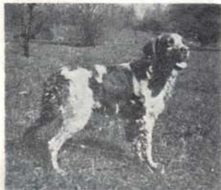
Ch. AVONO JAKE, a good sound hunting dog, sired several top winners.