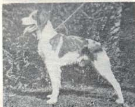
Ch. TUDOR DU ROC HELLOU, an import, though not much as a field winner, had a substantial influence for good as a stud dog.