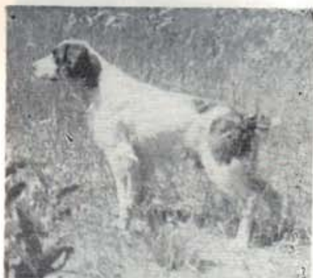
Fld. Ch. BENJJI OF LARUE, a liver and white stud of importance.