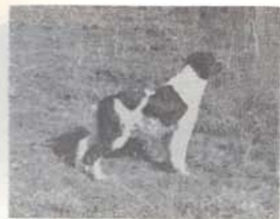
Dual Ch. TEX OF RICHMONT, the breed's top liver and white sire.