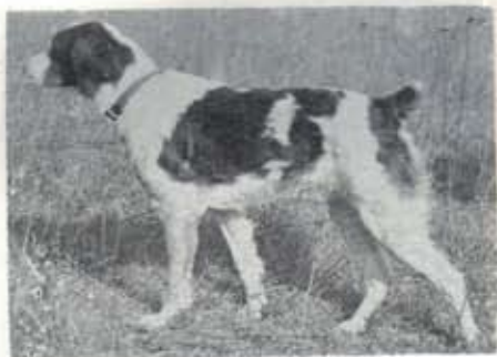
Dual Ch. AVONO HAPTE, a nationals winner, was an exceptionally good sire for his day.