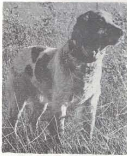
Dual Ch. DINGO'S LITTLE MIKE, an outstanding son of Pontac's Dingo, excellent in the field and an excellent producer.