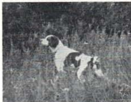
Dual Ch. UNO'S JET, a prominent sire and multiple field winner.