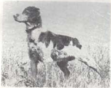
Dual Ch. TOWSEY, broke records as a Nationals winner. A very fine hunting dog.