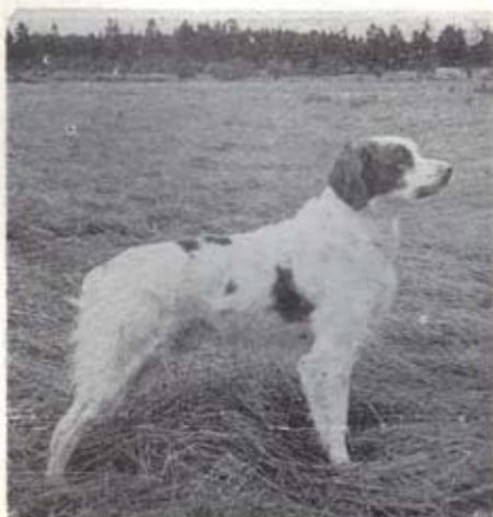
Dual Ch. Way Kan Jeff, first Canadian and American Dual Champion Brittany.