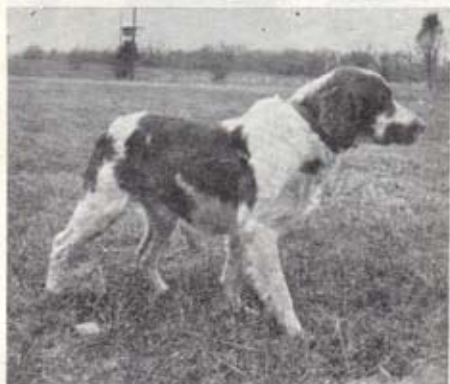
Dual Ch. Joel's Copper Jaques, top winner Open All-Age firsts.