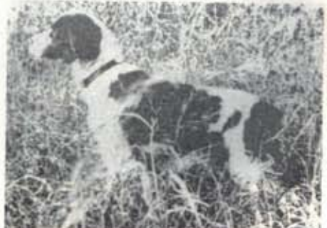
Dual Ch. TIGRE DE BLEMANOR, a good dual type.