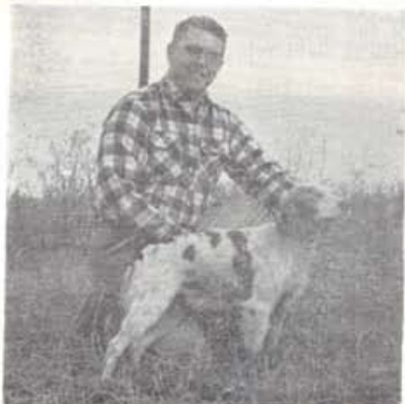
Fld. Ch. JEFF OF MINNEHAHA, a long record of placements, including National wins.