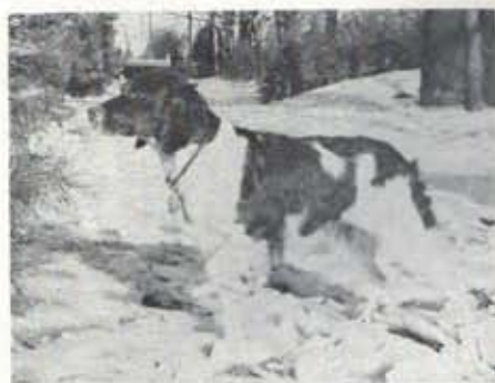
Dual Ch. KAYMORE'S MEGS, the first liver and white bitch to achieve a dual title.