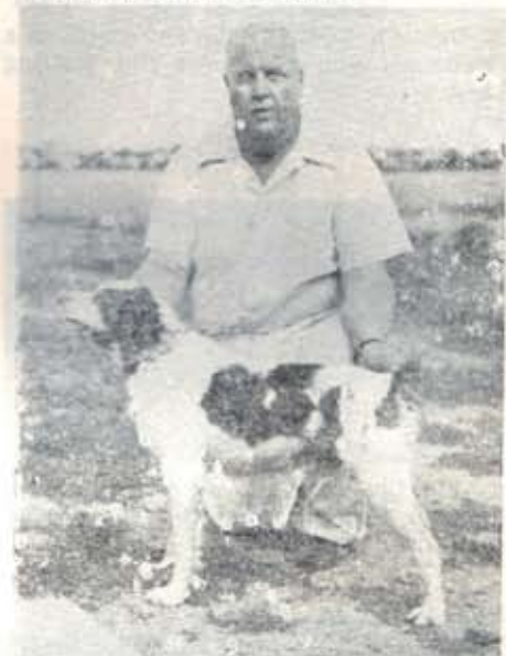
ALLAMUCHY VALLEY WARRIOR, sire of a great many winners.