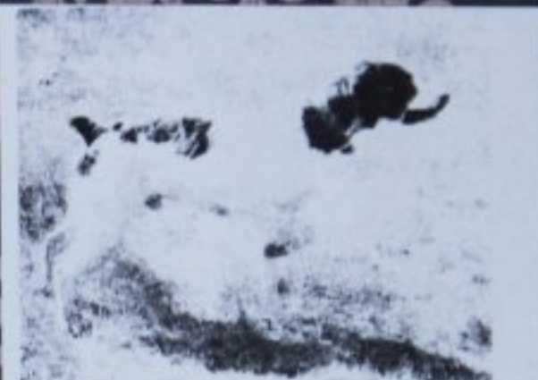
FC & AFC SCIPIO'S MR. CHIPS THIRD PLACE

The National Amateur broke away at 7:33a.m., Monday, November 26, 1979. It was a reported 39 degrees and a light frost still