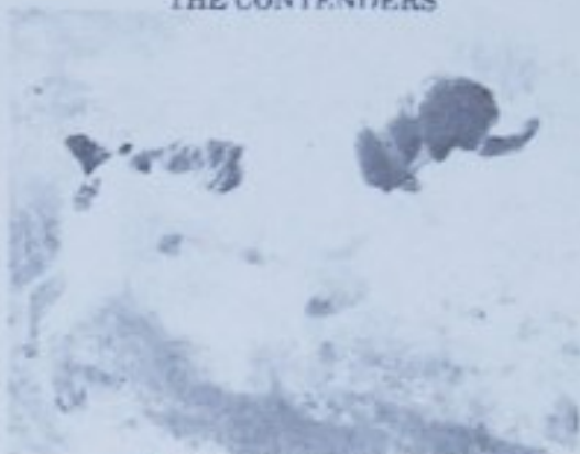
SCIP'S MISTER CHIPS THIRD PLACE

Brace 1: LITL SCIP OF BRANDY/LA-CHANCE-SCIP'S MISTER CHIPS/BROOKS. SCIP and CHIPS sizzled from the breakaway, taking wide swings to either side, then flying up the course to the songs of their handlers. Both dogs worked at full tilt, showing just often enough as they explored the hills and draws of the Fort Huachuca landscape. We reached the water at 25, and had only a gallery flushed Mearns Quail to show for this spectacular effort. From there, the course swung left, pivoting on a steep knoll overlooking the waterhole, and being bordered on the right by a tree-lined arroyo. Thirst quenched and bellies wet, the two tore out across the mesquite studded grassland, negotiating the turn in fine form. Crossing a shallow cut to the right, CHIPS made game and froze, with Brooks calling point. Jack had some difficulty finding the bird, and moved his dog up twice before flushing a single Chukar, as CHIPS stood proud. Gearing down after this perfect find, CHIPS maintained