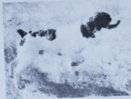
Second Place Scipio's Mr. Chips