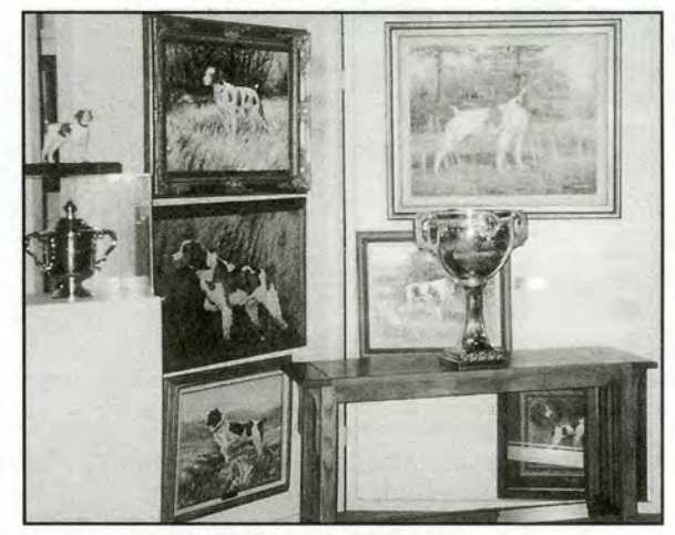
One of the Brittany Panels