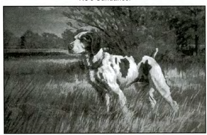
Franklin County Bandit