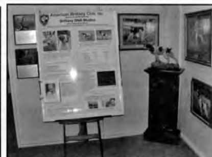
Pictured above, the Brittany corner of the museum.